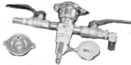
Pressure Tester/ Coolant Dams