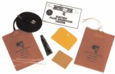
Electric Pad Heating