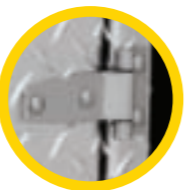
Stainless steel trap hinge