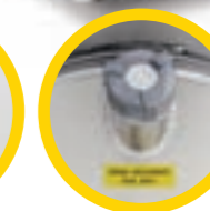
2" goose neck for filling up