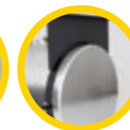
Steel mounting bracket