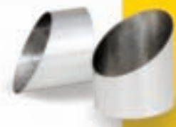
ADG SERIES Bright Light Deflector Diameter: 6" Length: 6"