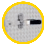
Aluminium lock handle