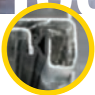
Integrated Rain Gutter (IRG) construction