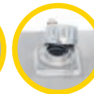
Filler breather cap