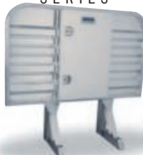
CGA enclosure cab guard 1 centered door enclosure