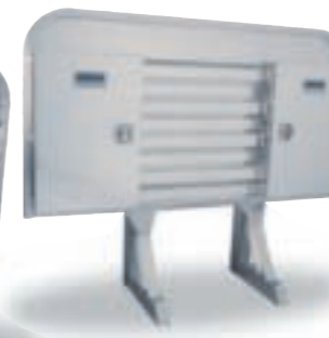
CGA enclosure cab guard 2 side door enclosure