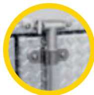
Aluminium cam-type Lock