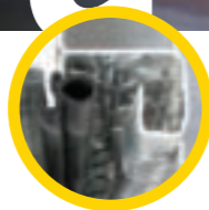
Automotive grade door seal

Coffre DPX 2 doors, 1 aluminium cam-type lock on left or right