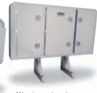
CGA enclosure cab guard 3 full door enclosure