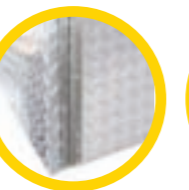
Stainless steel continuous hinges