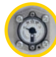
Mechanical level gauge

R22 tank Standard capacity 30,50 and 100 US gal, 22" diameter