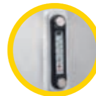
Rectangular level gauge with thermometer