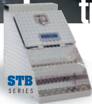
STB Stepbox STB183 With steps: Length : 18" Depth: 28" Height: 25"