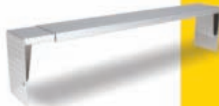
SERIES Cab Walk Length: 55" to 68" Depth: 10" Height: 15"

Norcan offers a variety of truck equipment :