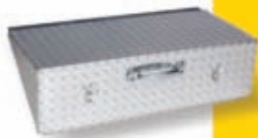
SERIES Battery Cover Length: 31" Depth: 15 5/8" Height: 9 5/16"