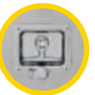
Stainless steel folding T-handle