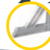
I-shaped extruded legs

CGB Cab Guard "I"-shaped extruded legs, aluminum diamond plate wall