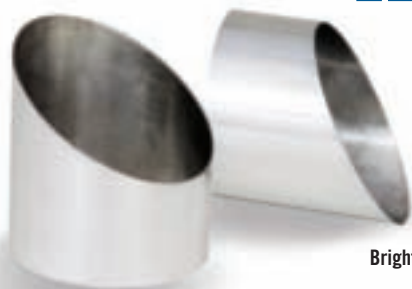
Bright Light Deflector Diameter: 6" Length: 6"