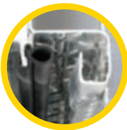
Automotive grade door seal