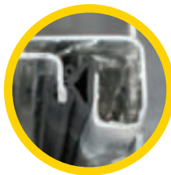
Integrated rain gutter (IRG) construction